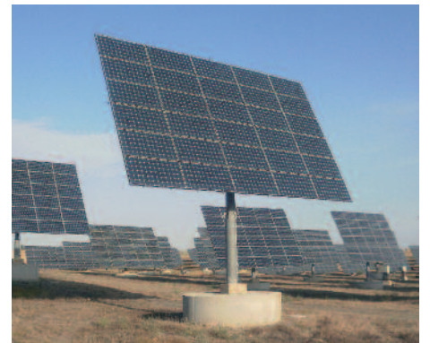
800 kW in solar trackers in Villanueva del Duque (Córdoba)