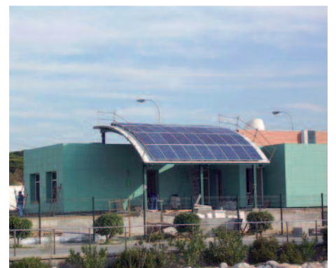
6.12 kW on a curved roof in the Information Point for the La Breña y Marismas Natural Park in Barbate (Cádiz)