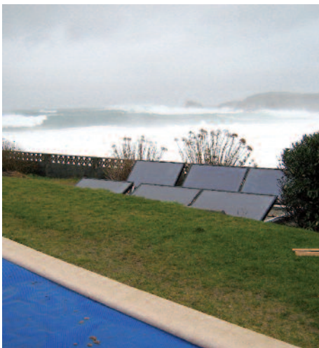
Solar thermal energy installation covering a total capturing surface of 12 m 2 for sanitary hot water and swimming pool heating in Meirás (Valdoviño)