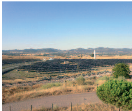
1.7 MW overground in a permanent structure in Peñarroyo-Pueblonuevo (Córdoba)