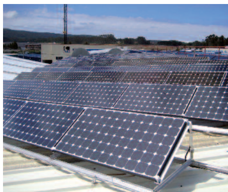
23.52 kW on a warehouse roof in Narón (A Coruña)